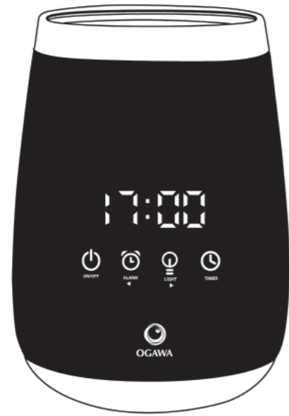
OA 1512 User Manual